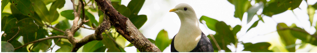
GUBARA (Photo Above - Banded Fruit-Dove)