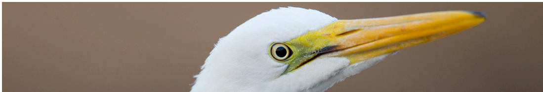
ANBANGBANG BILLABONG (Photo Above - Great Egret)

Gubara is an 8 km return walking track which leads you through some beautiful open habitat then right along side a beautiful escarpment leading you to an area of monsoon forest, the track leading to the escarpment is good for Chestnut-quilled Rock-pigeon, Weebill, Northern Rosella, Red-backed Kingfisher, Helmeted Friarbird and maybe even Partridge Pigeon. Once you get closer to the escarpment and the monsoon forest look for Banded Fruit-dove, Rainbow Pitta, Little Shrike-thrush, Buff-sided Robin, Shining Flycatcher and White-lined Honeyeater.