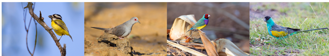
(Photo from left to right - Northern Shrike-Tit, Diamond Dove, Gouldian Finch & Hooded Parrot)

The Victoria River and Katherine Regions have to be a couple of my favourite places to go birding. Any free time I get I find my self-making the 500 km journey from Darwin to explore this area. Another great reason to head this way is there is the AMAZING fishing to be had at Victoria River. This fills in the hottest part of the day nicely when birds are least active.