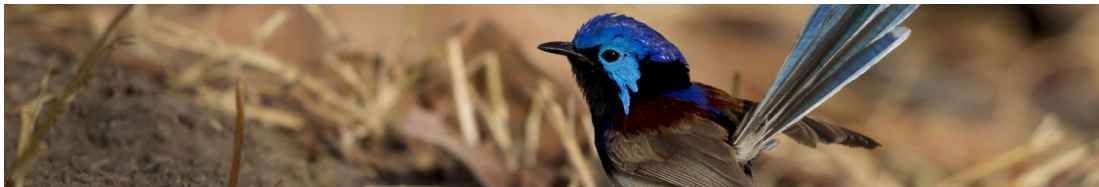
BUNTINE HIGHWAY (35 km Dam) (Photo Above - Variegated Fairy-wren)

Also keep an eye out right along this road for both Black-breasted Buzzard and Grey Falcon, which I have seen here a few times.