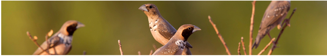
BUNTINE HIGHWAY (Photo Above - Pictorella Mannikin)