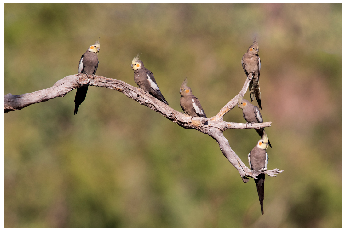
One of Australia's many iconic birds, the Cockatiel.

After breakfast we headed back towards Katherine, stops along the way found us perched Cockatiel, soaring Wedgetailed Eagle and a flock of around 100 Red-tailed Black-cockatoos. In the afternoon around Katherine we found better views of Fairy Martin finally showing its field mark Rufous cap and two new birds for the trip, Common Bronzewing and our last Honeyeater, Yellow-throated Miner. We also bumped into a nice feeding flock of Gouldian Finches, Masked Finches, Hooded Parrots, Grey Shrike-thrushes, Little Friarbirds, Varied Sittela, White-winged Trillers, Black-faced Woodswallows, Blue-faced Honeyeaters and a fly over pair of Northern Rosellas, a great way to end the day.