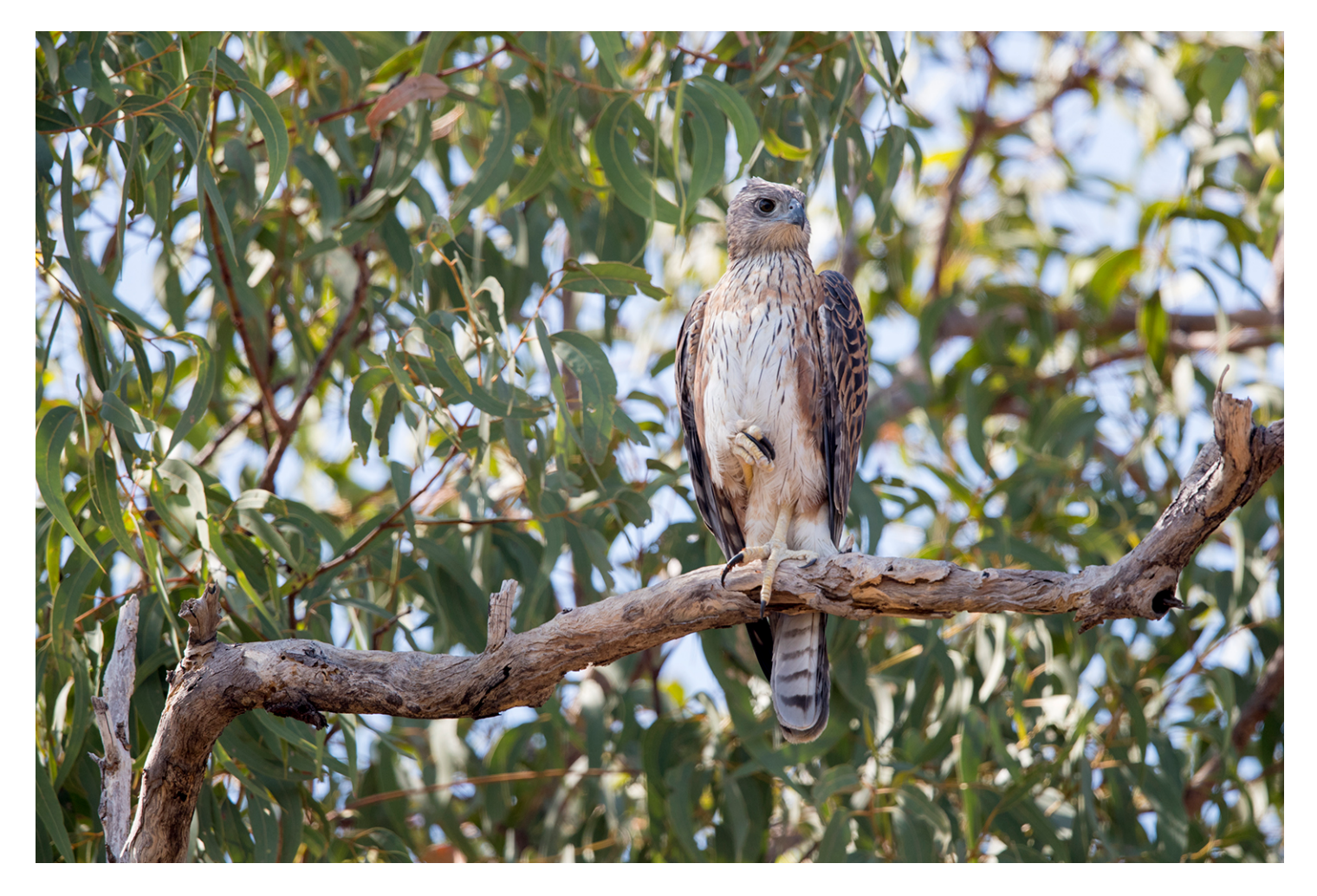
One of the world's rarest birds of prey, Red Goshawk.

Arriving at Pine Creek we had a much deserved break before heading out again late that afternoon, we enjoyed great views of Great Bowerbird at his Bower, Red-backed Kingfisher, Black-faced Woodswallow, Blue-faced Honeyeater, Redcollared Lorikeets, White-throated Honeyeater, White-breasted Woodswallow and our the main reason we stay in Pine Creek, the spectacular and locally endemic Hooded Parrot. Lucky for us we had about 50 individuals coming down to pre-roost, a great way to finish the day.