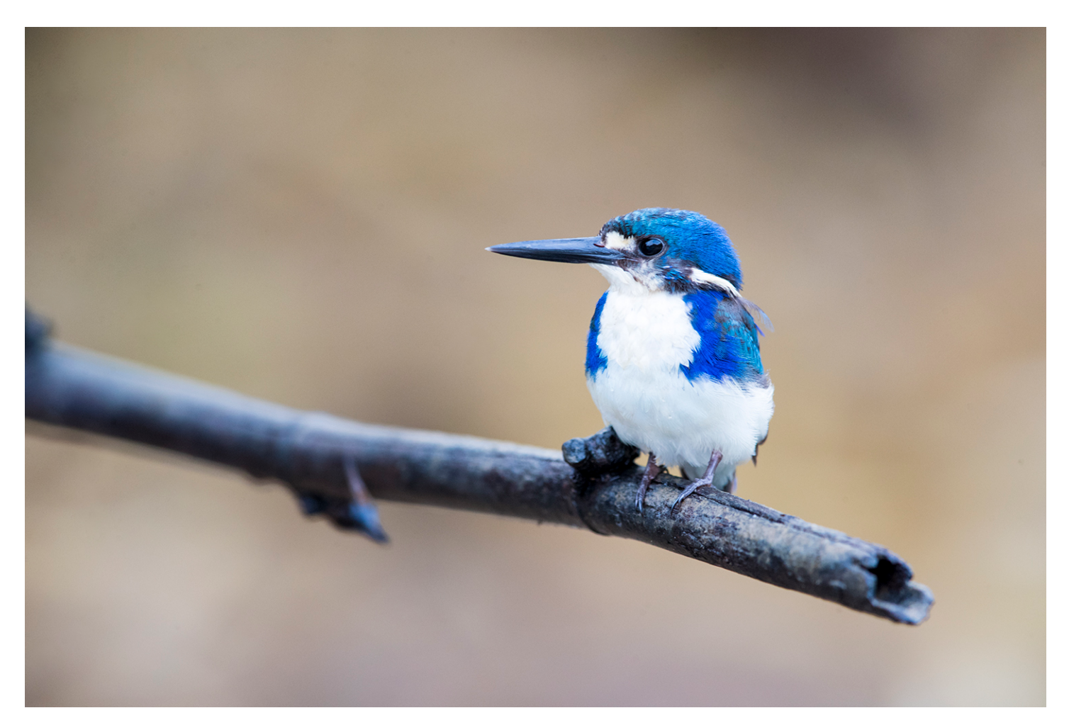
The main target on Yellow Water and the second smallest Kingfisher in the world, Little Kingfisher.

This morning we were booked on the world famous Yellow Water Cruise, arriving nice and early we got front row seats and settled in to see what this picturesque morning would to bring. It didn't take long to start ticking up the birds; Green Pygmy-goose, Forest Kingfisher, Sacred Kingfisher, Brolga, Black-necked Stork, Plumed Whistling-duck, Wandering Whistling-duck, Magpie Goose, Comb-crested Jacana, Dusky Moorhen, Brush Cuckoo, Red-kneed Dotterel, Australian Pratincole, Rufous Night-heron, Glossy Ibis, Royal Spoonbill, Tree Martin, Crimson Finch and Paperbark Flycatcher. Highlights were a pair of Maned (Wood) Ducks and incredible views of both Azure and Little Kingfishers.