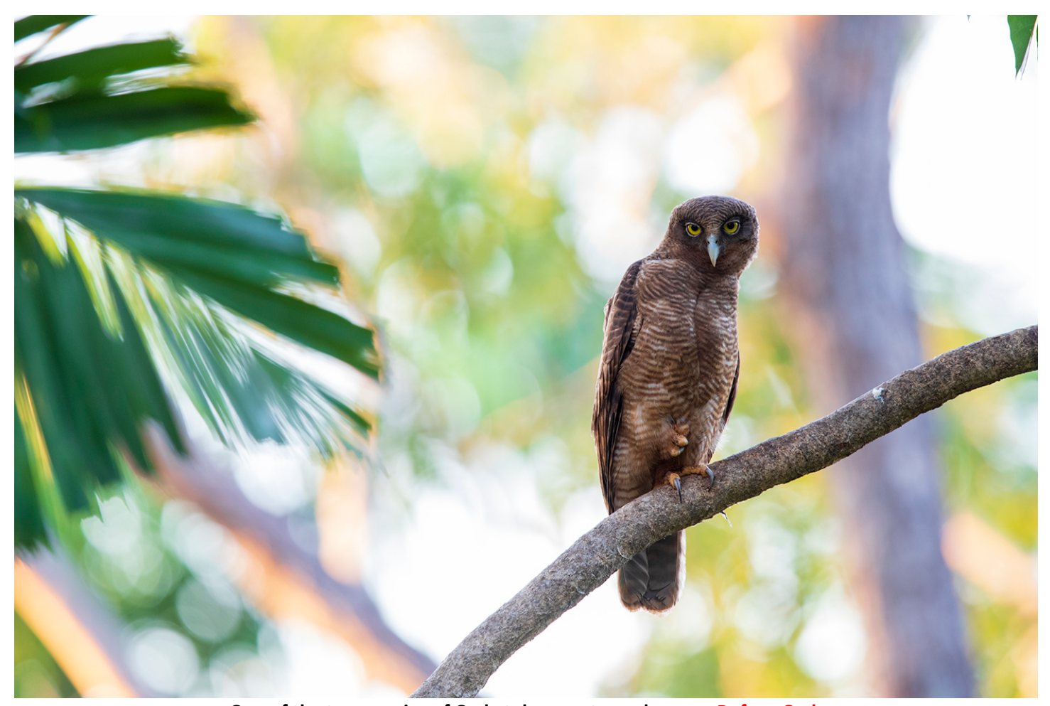
One of the two species of Owl at day roosts on day one, Rufous Owl.

After a great lunch at one of Darwin's best cafes we visited George Brown Botanic Gardens, here we were in search of some day roosting Owls. It didn't take long and we found out first target, Rufous Owl! We had both male and female sitting together on an open branch, a spectacular sight. Next we went in search of Barking Owls, we didn't find them in their normal roosting spot but after waiting patiently for a few minutes I heard one calling near by. We walked over and found one of the pair sitting right out in the open.