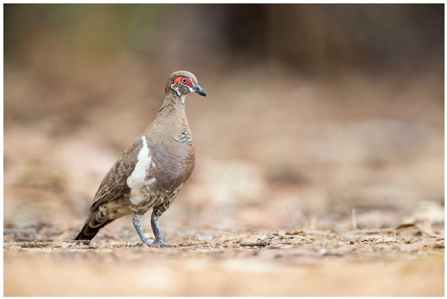
The first of the Kakadu specalties, Partridge Pigeon.

It was now time to head west towards Kakadu; we had a fair few sandstone endemics to find this afternoon so we headed off as early as possible. Our first stop was a site near Jabiru to look for Partridge Pigeons, lucky for us we had 15 or so relaxing in the shade providing amazing views for everyone.