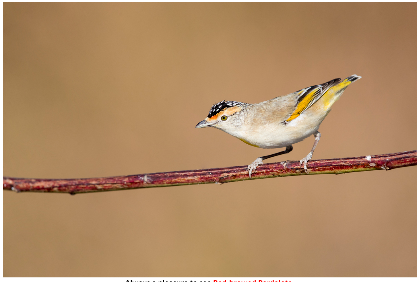
Always a pleasure to see Red-browed Pardalote.

Day five we headed west of Victoria River in search of our next new birds, arriving at one of my favourite sites in the area we soon found Jacky Winter, Little Woodswallow, Black-chinned Honeyeaters and great numbers of both Pictorella Mannikins and Gouldain Finches. Searching the area even further we found a single Grey-headed Honeyeater and an extremely cooperative group of Spinifex Pigeons. A quick stop before breakfast we picked up the tiny little Red-browed Pardalote.