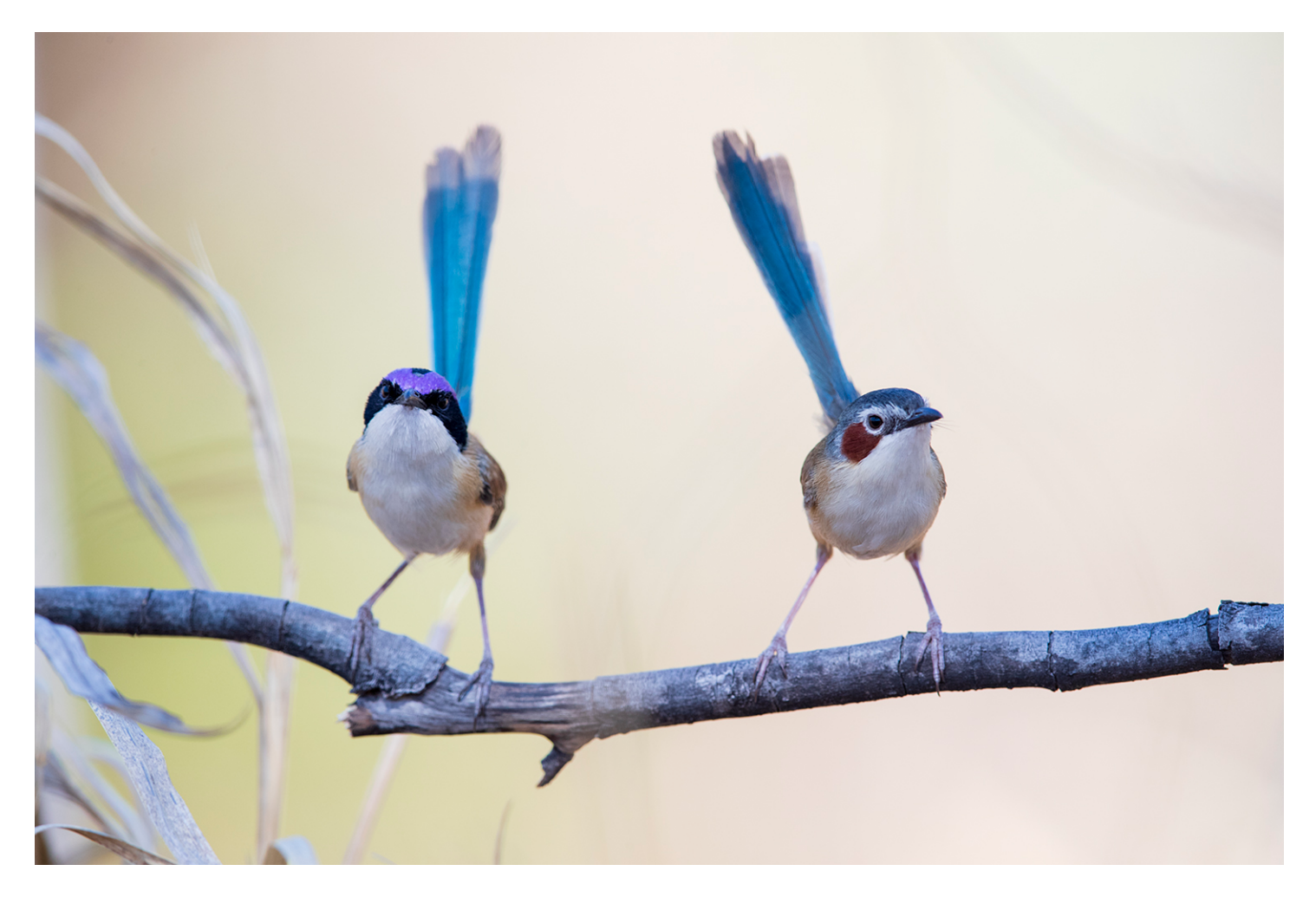
A great bird to finish the day, a pair of Purple-crowned Fairywren.

We finished the day with great views of Brown Falcon, Nankeen Kestrel and a very friendly Red-kneed Dotterel.