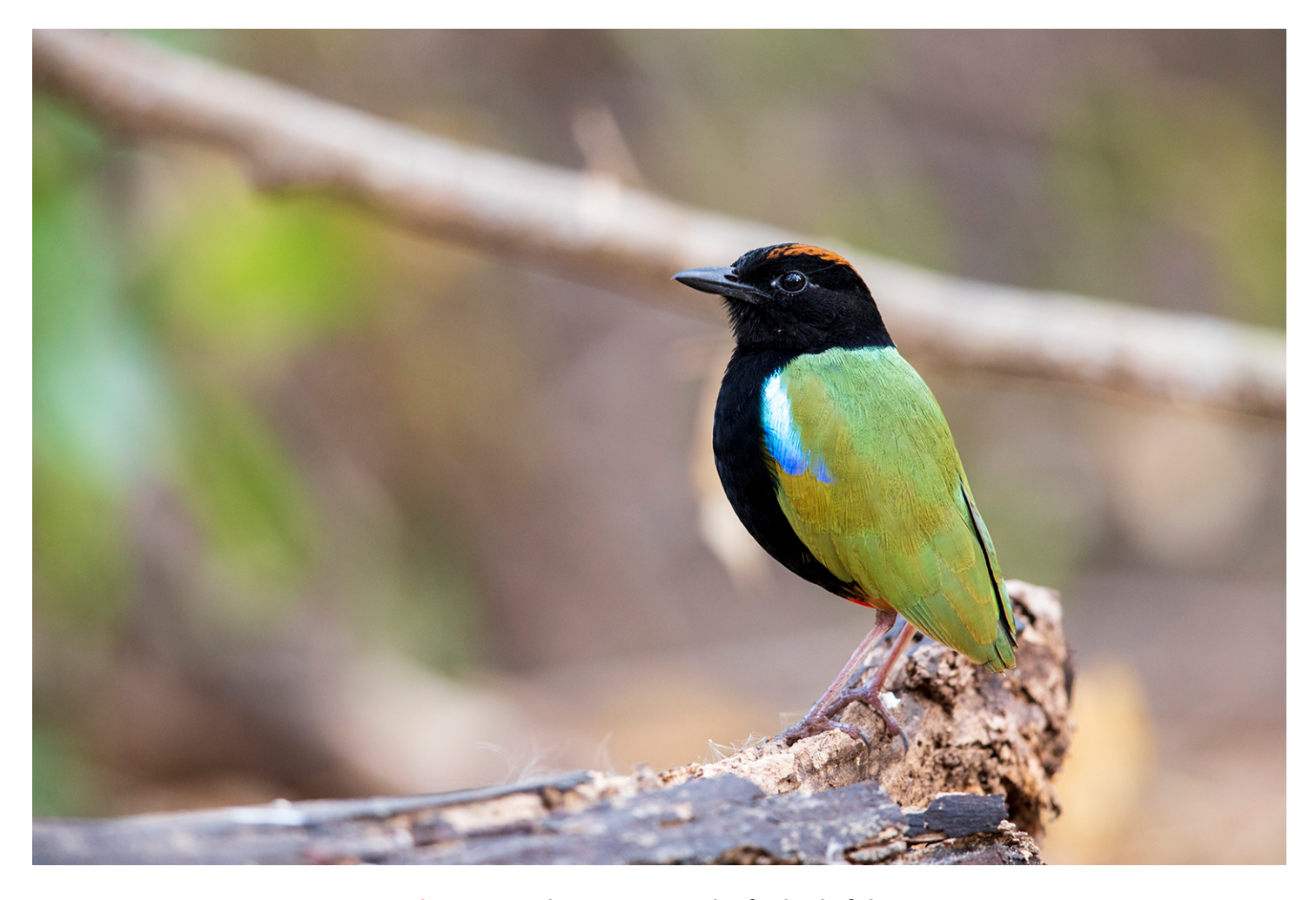
Rainbow Pitta, always a contender for bird of the trip.

Arriving at a monsoon forest nearby, we were greeted by Lemon-bellied Flycatchers, Leaden Flycatcher, Bar-breasted Honeyeater, Rufous-banded Honeyeater, Brown Honeyeater, Grey Whistler, Helmeted Friarbird, Shining Flycatcher, Arafura Fantail, Northern Fantail and Green-backed Gerygone. Highlight of the morning was an extremely cooperative Rainbow Pitta sitting in the open only 5 meters away allowing for some amazing photos.