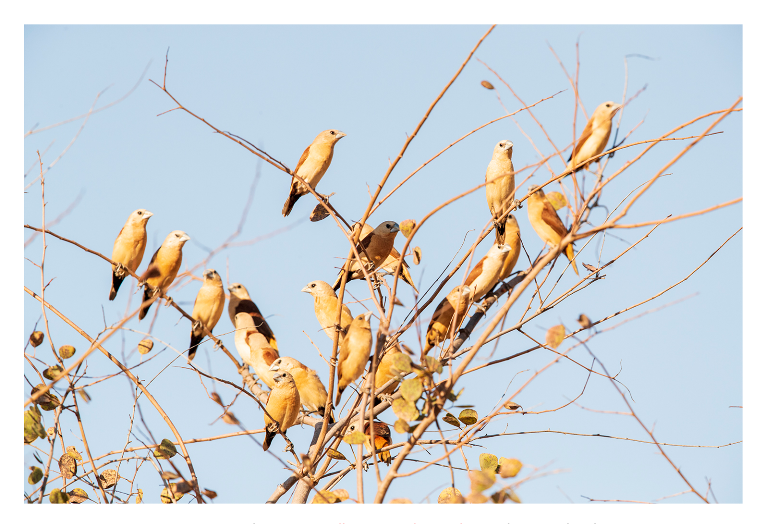
Its not every day you see Yellow-rumped Mannikins in these numbers!

The afternoon session was spent in the near by grasslands in search of our last Finches for the trip, we headed straight to an area I found them last week and straight away we got onto a few Star Finches followed closely followed by our first Yellow-rumped Mannikin. Soon after we had a large feeding flock containing at least a hundred Yellow-rumped Mannkins and few Chestnut-breasted Mannikins, good numbers of Star Finches and also 10 or so Pictorella Mannikins. A dream mix of Finches! Not far down the road we located a feeding group of Star Finches and Crimson Finches, bringing up 9 species of Grass Finches for the day!